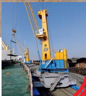
The cranes owned by Gemeentelijk Havenbedrijf are in use throughout the Port of Antwerp