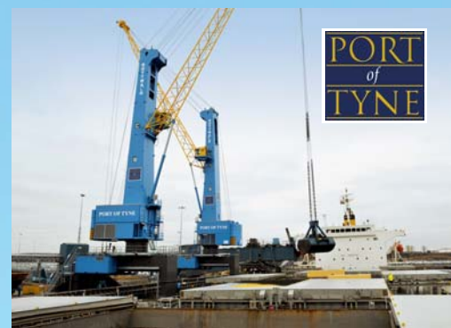
Gottwald Portal Harbour Cranes