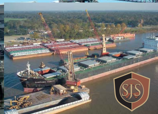
Gottwald Harbour Pontoon Cranes